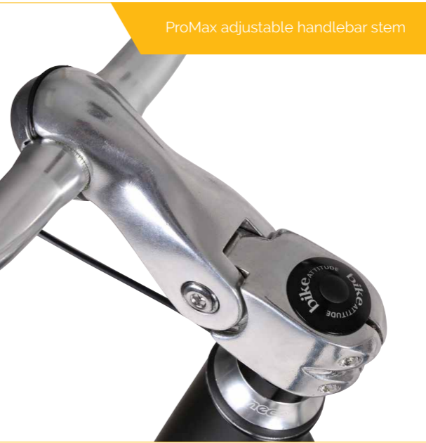
ProMax adjustable handlebar stem