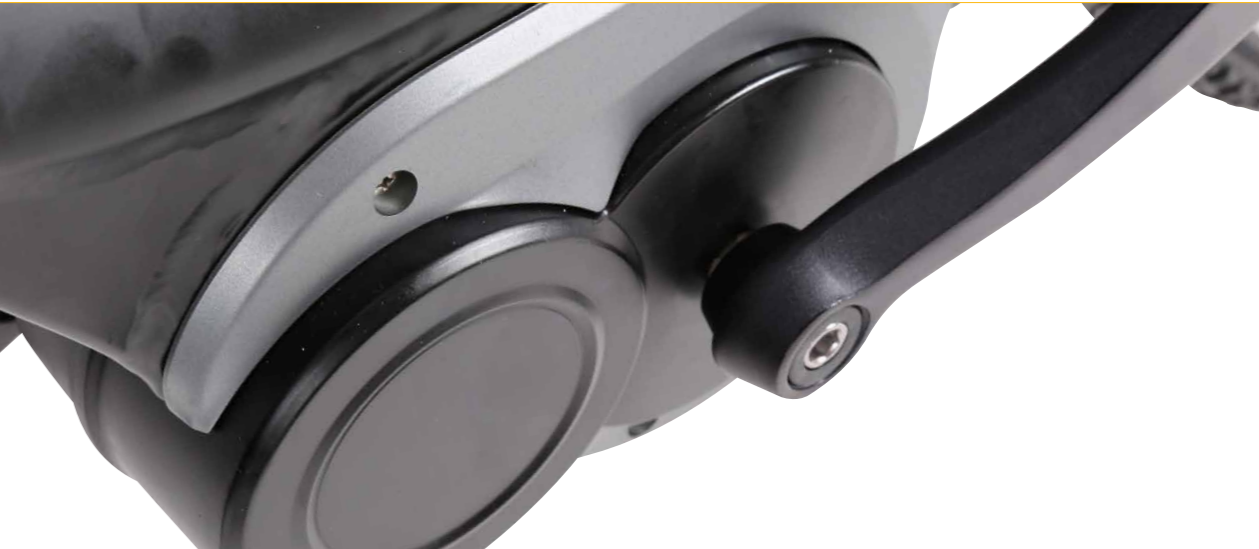
Center motor with integrated mag torque and sensor

All technical specifications are subject to change.